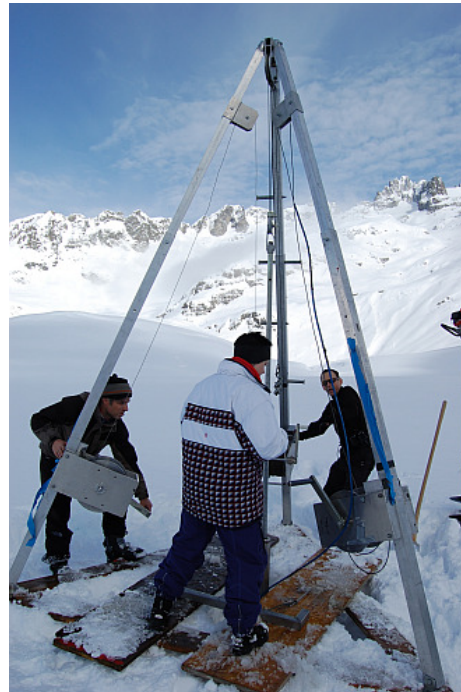
In order to provide a stable enough platform for the core extraction equipment the lake had to be covered with a thick ice layer.