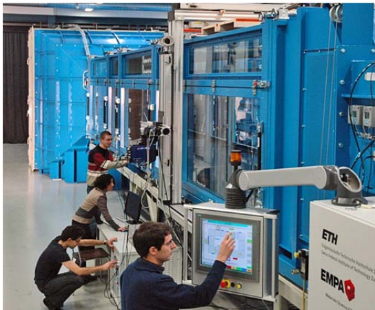
Working on the wind tunnel operated by Empa and the ETH.